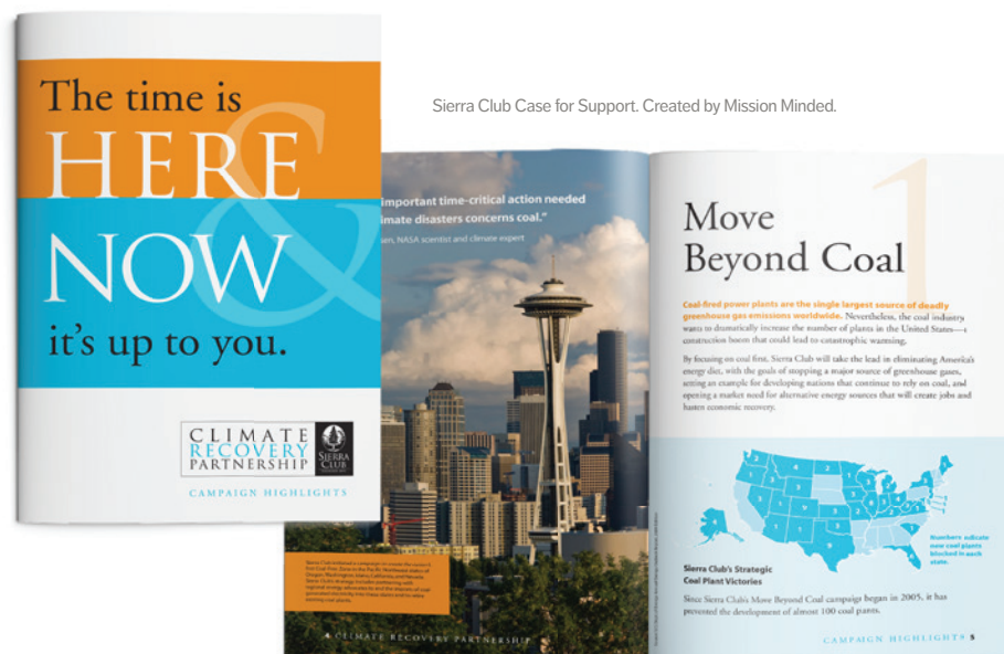
Sierra Club Case for Support. Created by Mission Minded.

Examples here are due diligence, costs, etc. For the Los Angeles LGBT Center, a point of rationale was that they had successfully completed capital campaigns of a similar magnitude in the past, with great benefits to those they serve.