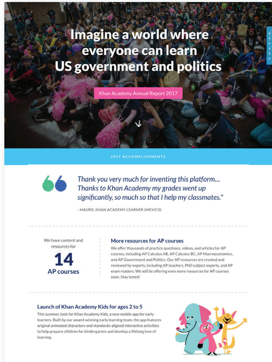
Khan Academy. "Imagine a world where everyone can learn..."

Choose powerful photos. Your annual report should be filled with photos that are up-close, colorful, and active. These photos should depict your mission in action. What's more compelling: a picture of your smiling constituents benefiting from your services, or a group photo at a fundraising function?