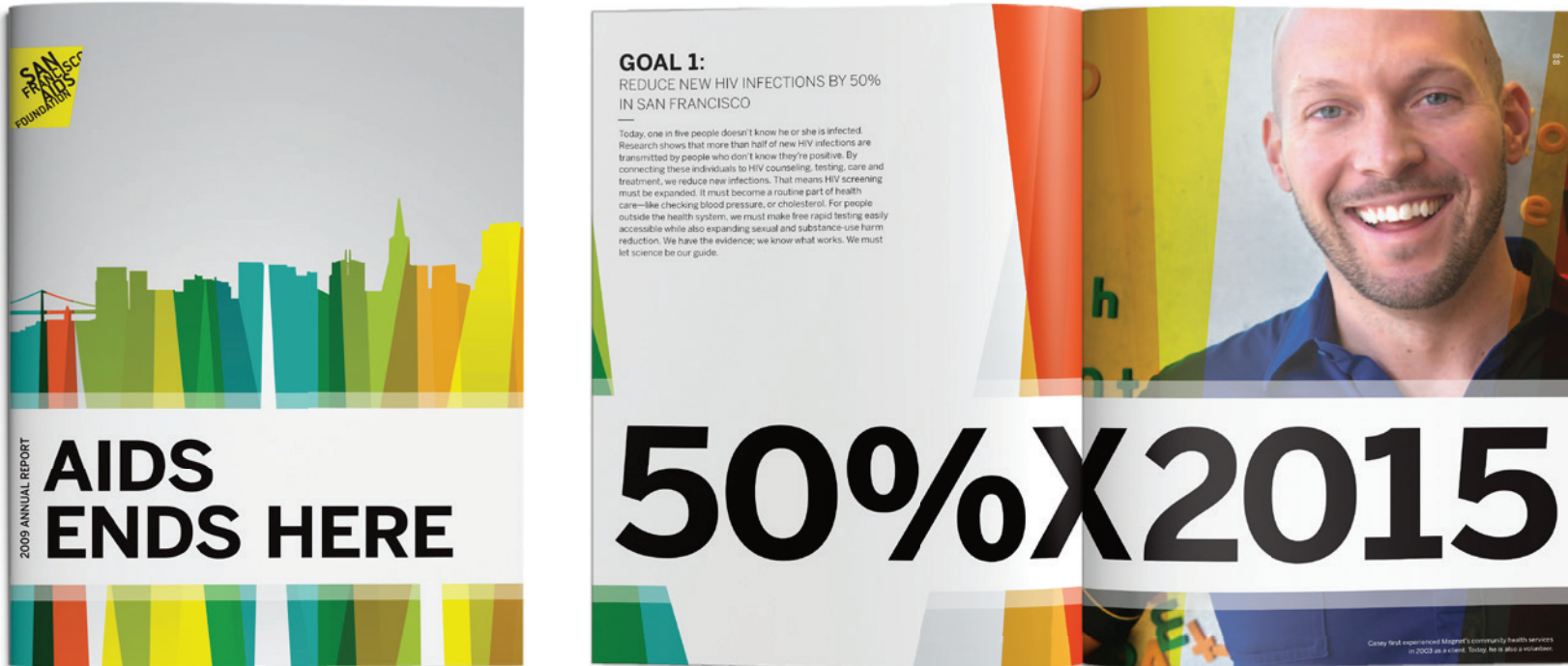
San Francisco AIDS Foundation. "AIDS Ends Here"

Your nonprofit's annual report is more than just a legal document; it's a fundraising tool. Creating one that captivates your donors can be one of the most important fundraising moves you make all year.